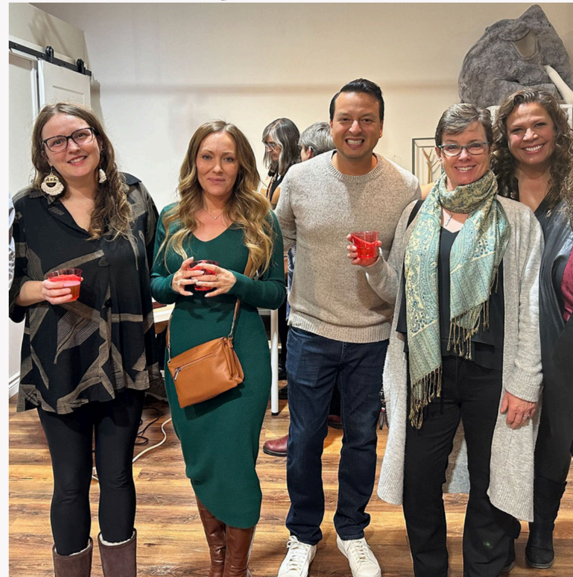
▲ NETWORKING GROUPS & MASTERMINDS