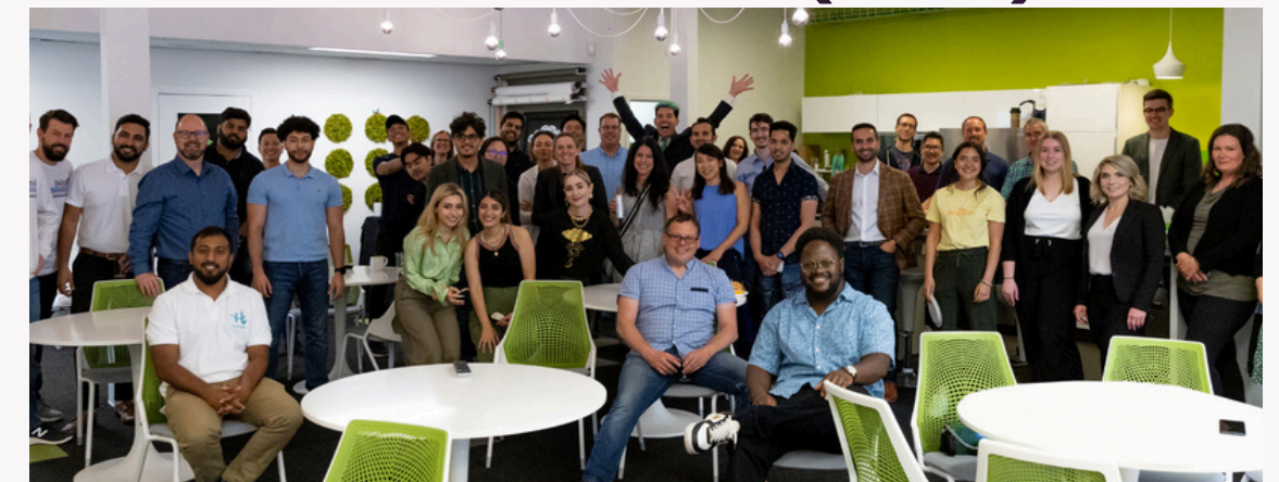
▲ ACCELERATE CENTRAL YORK