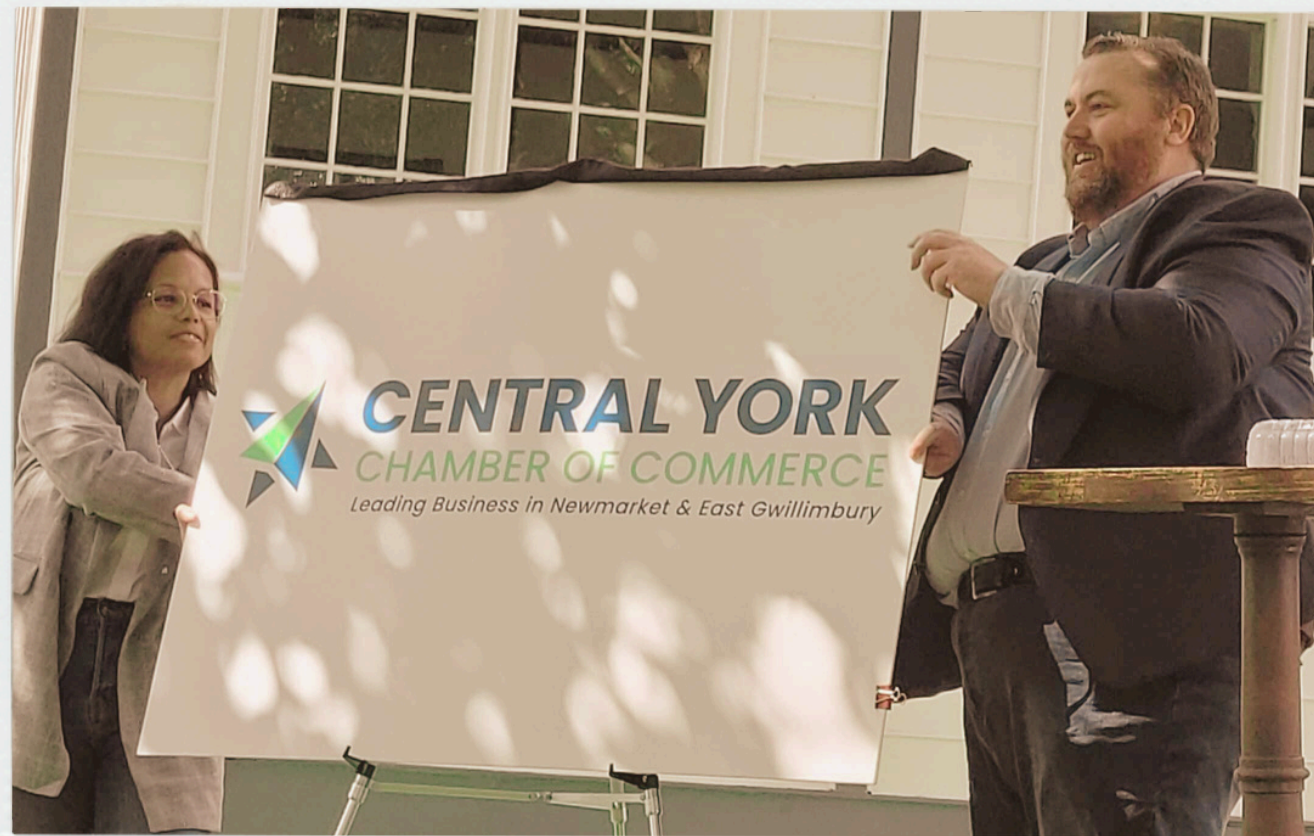
THE MERGER WAS FORMALLY ANNOUNCED IN SEPTEMBER, 2023 AT THE ANNUAL BBQ.