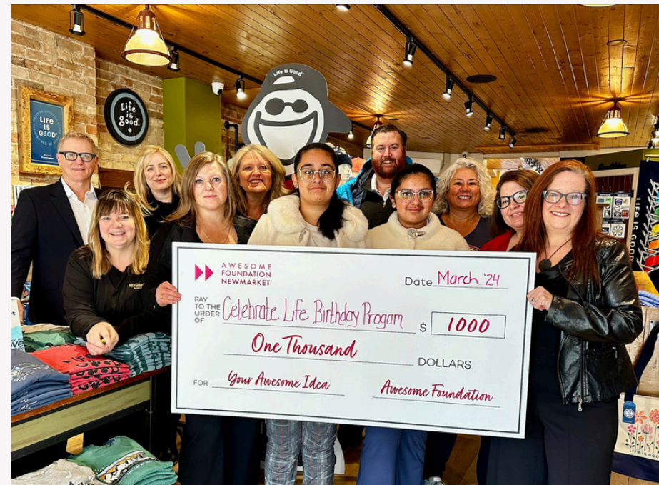
▲ AWESOME FOUNDATION ▲ NEWMARKET