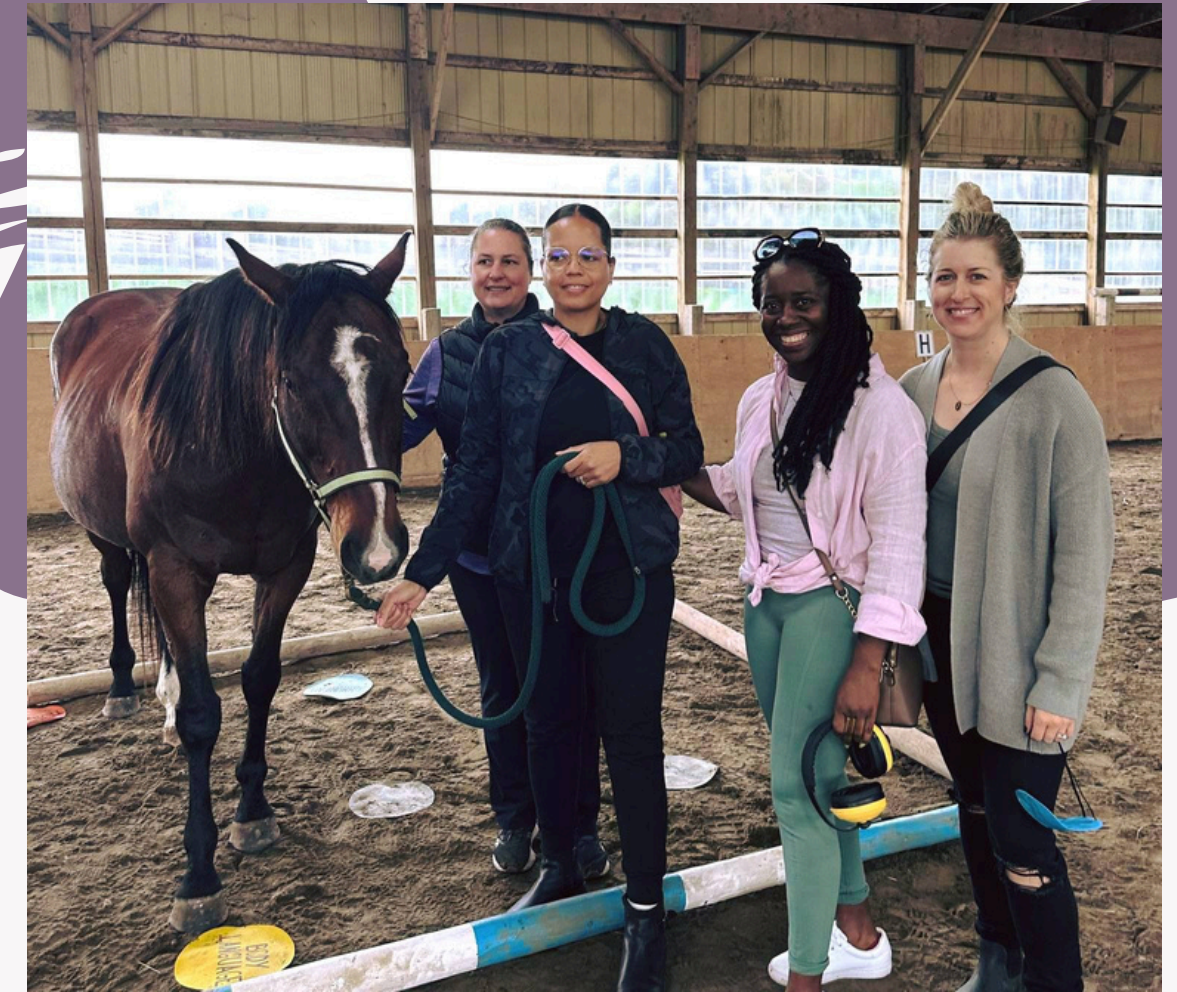
▲ WOMEN IN LEADERSHIP DEVELOPMENT (WILD)